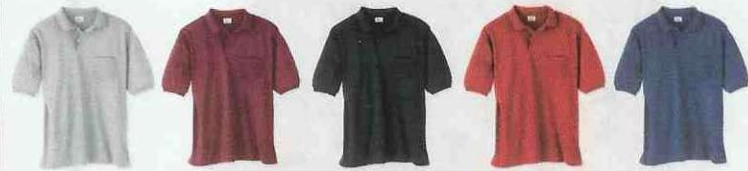
Lt. Steel Maroon Navy Red Royal

Available Colors: [also available in white]