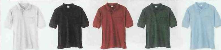
Ash Black Cardinal Forrest Lt. Blue