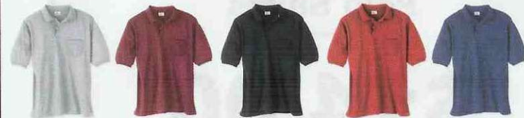
Lt. Steel Maroon Navy Red Royal