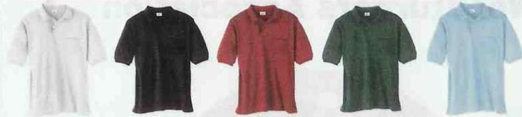
Ash Black Cardinal Forrest Lt. Blue